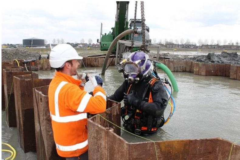
Figure 2 A diver doing classification of a detected target at large depth. A building pit is set in place by inserting sheet piles and excavating the soil. The pit is fully filled due to ground water that is present almost up to the surface at this location.