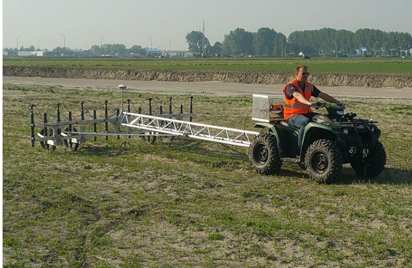
Figure 1 A field specialist carrying out target detection measurements in the field. For efficiency, eight probes are operated simultaneously, towed by an all-terrain vehicle. The frame carrying the probes is separated from the vehicle by a long non-magnetic aluminium rod, so as to minimize the magnetic disturbance of the vehicle.